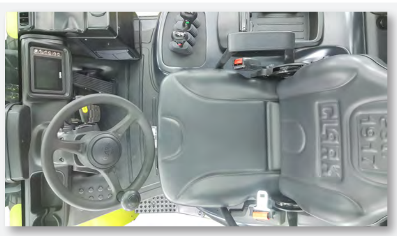
Driver cabin (fully equipped)

Hydraulic levers or mini-levers within easy reach and up to 5 hydraulic functions enable the use of different attachments