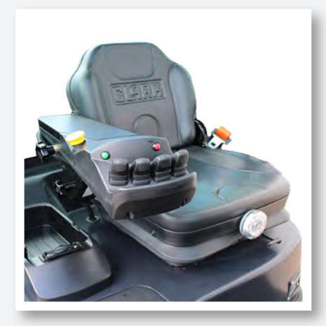
Individual hydraulic functions

With our extensive range of options, you can adapt your forklift to suit your individual application.