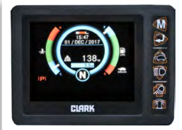
Load weight measurement

Automatic tilt lock when upright is in vertical position