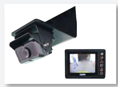
Rear view camera

Heating with proportional heating control valve —double-section side door — — sliding windows — Bluetooth radio with USB port — — front and rear wiper — heated rear screen — cup holder, storage box and document holder